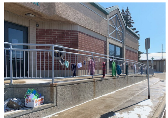
Clothesline of Kindness Elspeth Reid Family Resource Centre