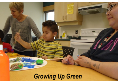
Growing Up Green

For the first time, we presented Growing Up Green —a Bookmates parent and child literacy program to encourage natural play and exploration—that was a great experience for participants. Family literacy remains a strong focus for us and we offered several different programs for families to strengthen their joy of learning together.